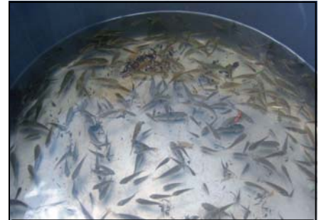
TILAPIA AND CATFISH