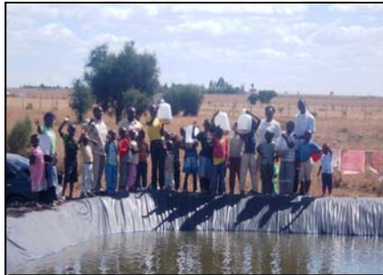
PREPARING TO RELEASE