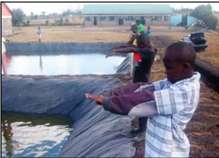
ASKING GOD'S BLESSING