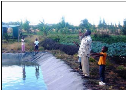
PRAYING OVER PONDS