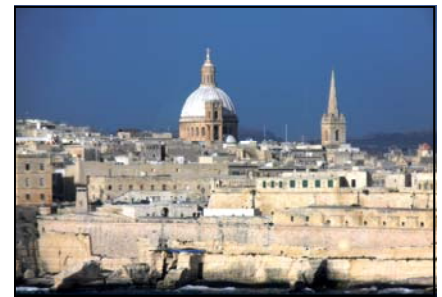
ISLAND OF MALTA